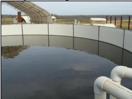
Kings Mill Dairy

Project # 571 Kings Mill Dairy Methane Gas Digester Feasibility Study —This project supports the Land Management Element, sub-element “Energy Conservation and Alternative Energy Production”. Kings Mill Dairy milks over 1400 cows, has 5 waste storage lagoons and one waste storage tank. Owners were curious to see if they had enough waste to fuel a methane gas digester. Engineers were brought in from Cavanaugh and Associates to assess the dairy operation and make a determination. Initial results indicated that there was sufficient waste and a steady waste stream to fuel a digester. The landowner is currently researching and traveling the upper mid-west to determine which digester to install. It is presumed that PCC will assist Kings Mill Dairy with a USDA 9006 grant this winter to bring in federal dollars for the first project of its kind on a dairy farm in North Carolina.